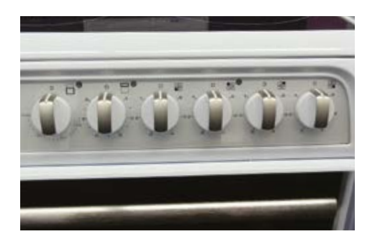
Controls are on the front of this electric free standing cooker. This keeps the hands away from the hot ceramic plates

Consider how much you need to reach over or into a hot cooking area.