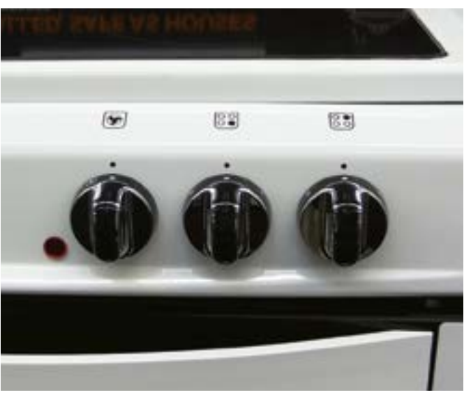
Controls are easy to identify on the front of this free standing cooker