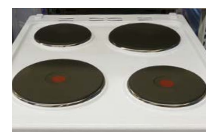
This electric plate hob has high contrast heating zones

Look for elements which have a strong visual definition from the background.