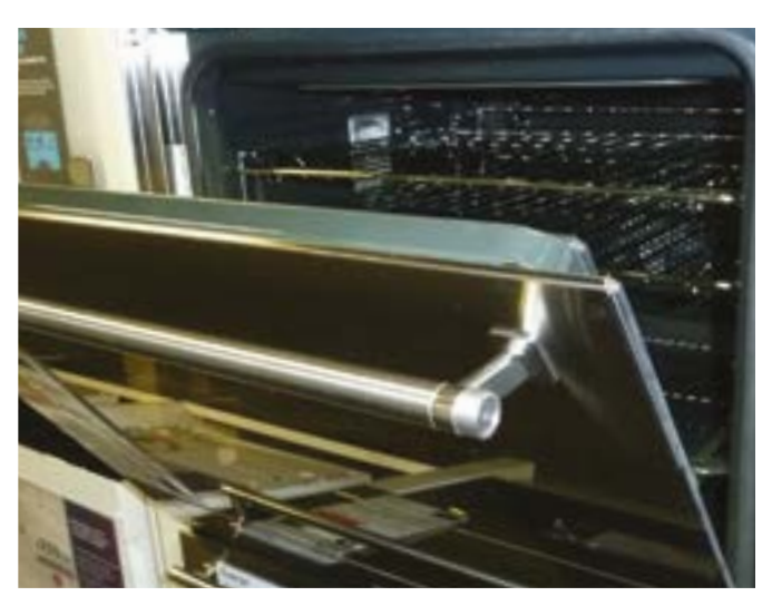
The handle on this oven sticks out and could catch on your clothes. The grill door also sticks out when it is open