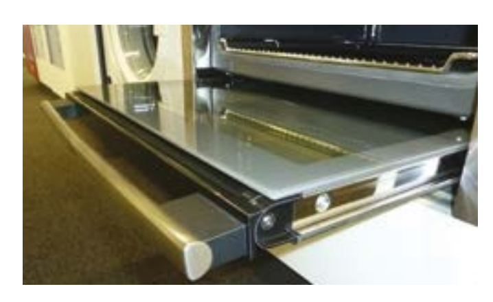
This oven door slides underneath the oven when it is pulled down so it won't get in your way

Look for features which are tidy and won't catch your body or clothes.