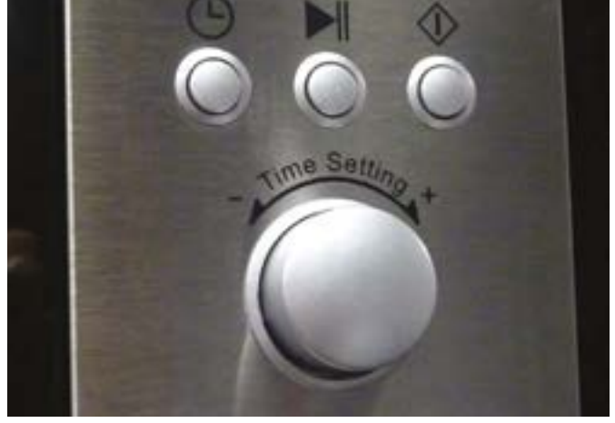
Controls – Dials that toggle left and right to decrease or increase setting

They use numbers displayed on a screen to indicate the setting on the dial