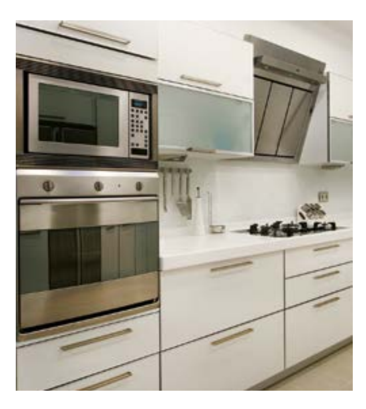
This kitchen has a microwave in combination with an oven ("built in"), and a separate hob