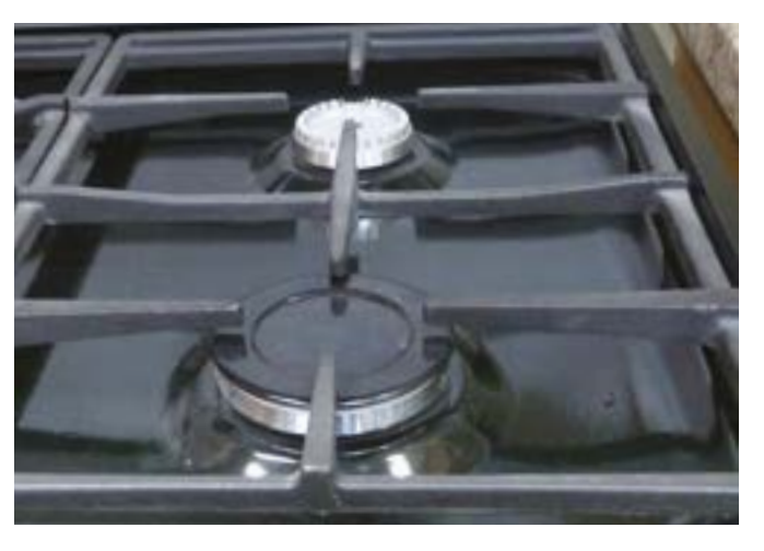
Another example of a sunken well which will capture spillages, this time on a gas hob