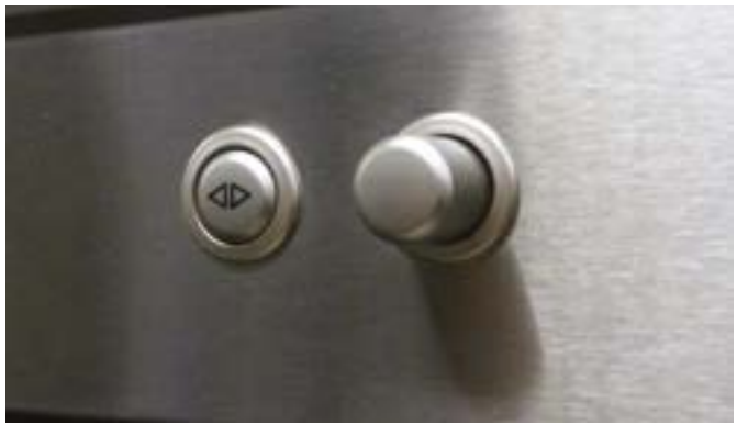
Another example of buttons that pop out