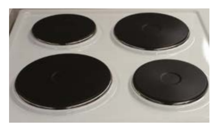
This electric plate hob has a well around the plates which provides an easy place to capture any spillages