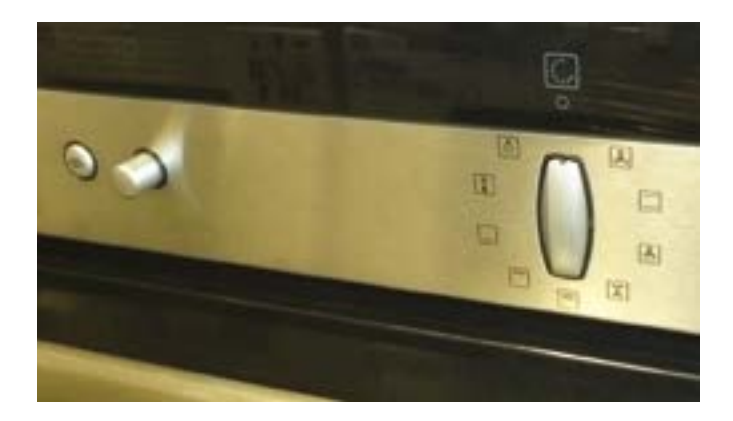
Buttons that stay pushed in or pop out to indicate on or off

Look for elements which give tactile indicators of control state or position.