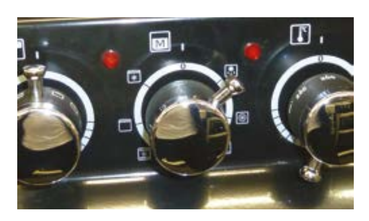
These dial handles offer a clear indication of their position. The functions can be learnt by counting the steps from the top of the dial

Bumps and marks about the dial to help indicate the position.