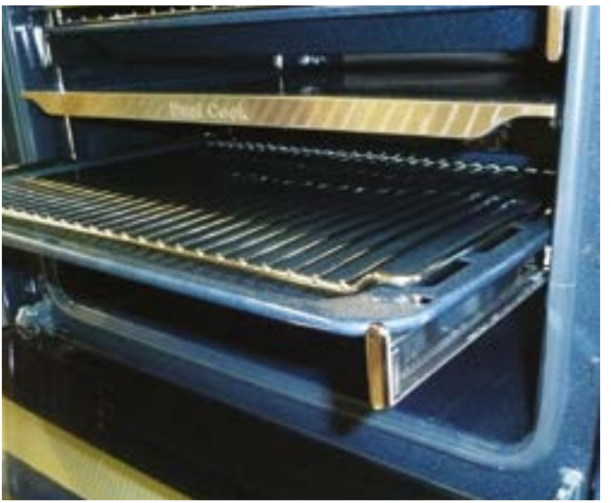
Pull out shelves will minimise the need to reach into the hot oven These can be pulled out full distance without tipping out of the oven