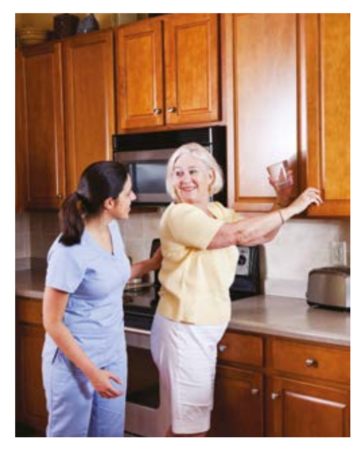
Health professional giving advice at home

Home Improvement Agencies may also provide useful advice. They are local organisations that help older or disabled home owners to organise adaptations, building work and home repairs. To find your local agency Tel 0845 864 5210 or www.foundations.uk.com.