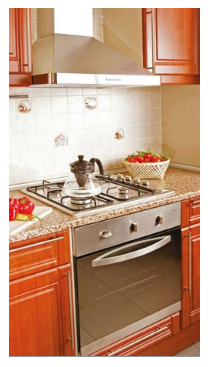
The appliances in this image are separate, with the oven placed underneath the hob ("built under")

• What is your life experience of cooking appliances?