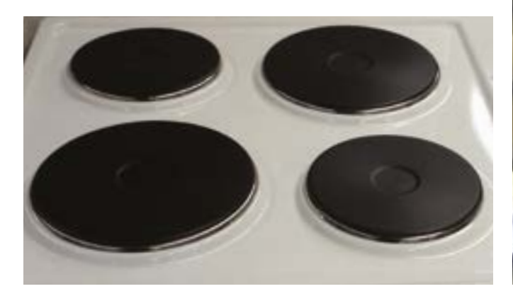
This electric hob plate has a stable and well defined area on to which to place pots and pans

Feel the position of the active cooking area through the placement of pots and pans.