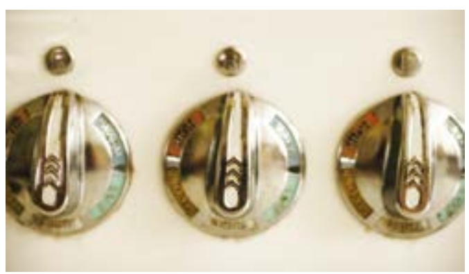
Another example of dials with a clear indication of their position