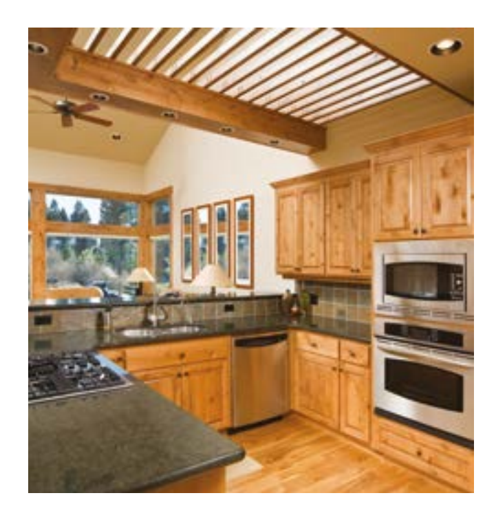
Having the oven and hob sited separately is fast becoming the standard way of arranging kitchen appliances