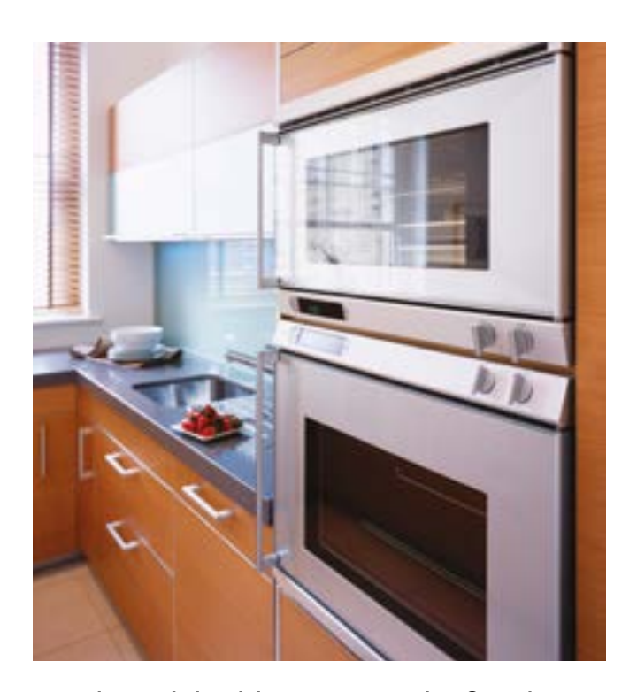
Single and double ovens can be fitted higher into a housing unit and placed at work top level ("built in")