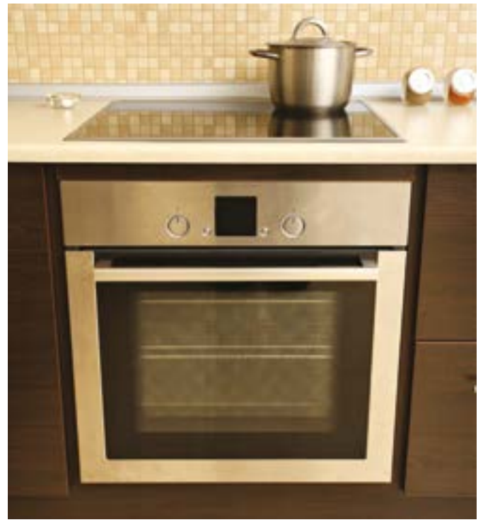
Induction hob with single oven placed underneath ("built under")