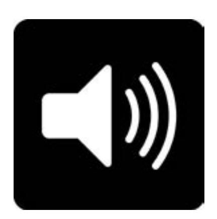
Too many 'beeps' and 'tings' can get confusing

Look for audio outputs to help indicate cooking appliance settings