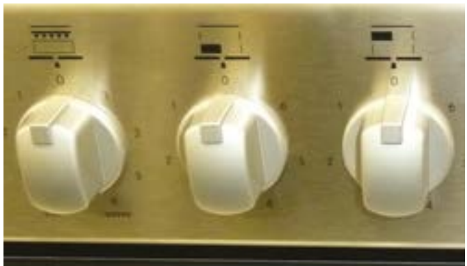
There are well defined clickable heating settings (1 to 6) to this electric hob