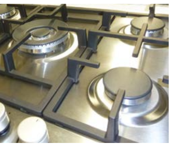
This gas hob has a poor pan location and support area